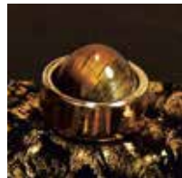
Tiger's Eye rivets